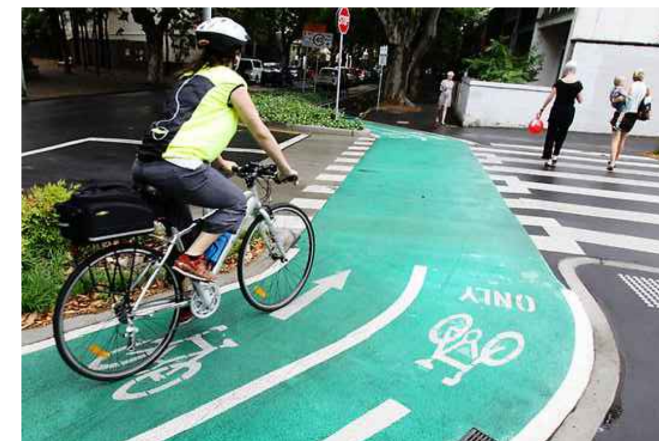
BEND OUT CROSSING AT INTERSECTION

The roundabout at the Piazza is also proposed to be upgraded to modern standards, helping increase safety and allow a more generous turning space.