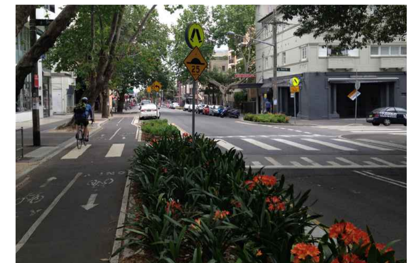
ZEBRA CROSSING ADJACENT BI-DIRECTIONAL CYCLEWAY