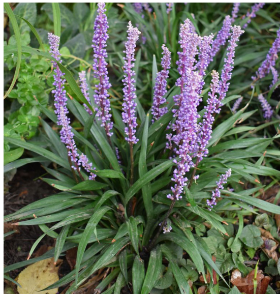
Liriope muscari 'Big Blue'